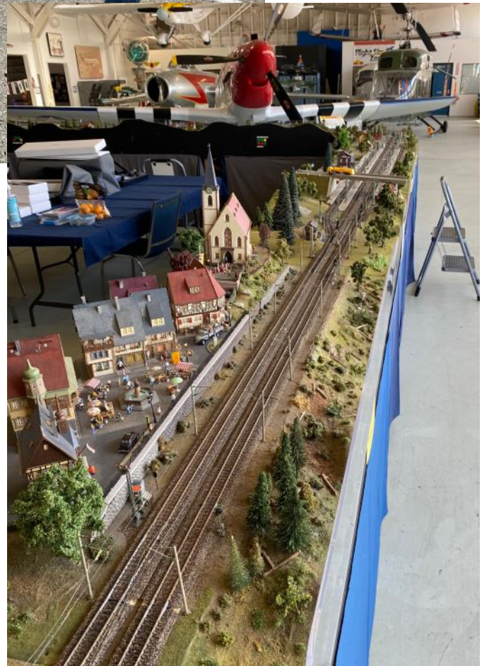
Above: Diamantine's car next to the museum's flying boat Right: Trains at the Airplane Museum