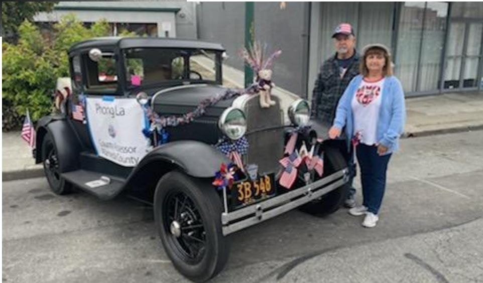
Below: Great turnout for the parade