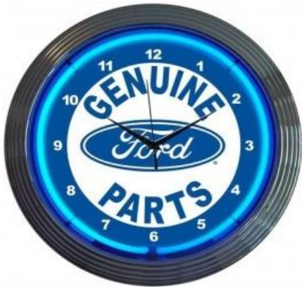
Time For Birthdays