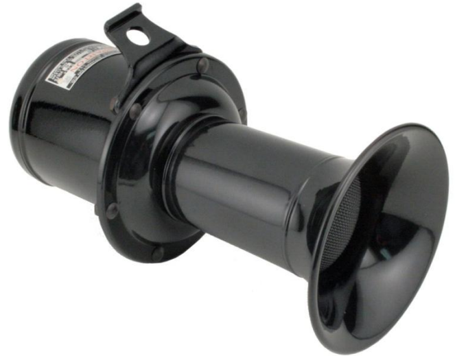
A Model A horn manufactured by the Sparks-Withington Corporation (Sparton).

According to the Judging Standards, the Model A came equipped with one of the following horn brands: Sparton, Ames, Stewart-Warner, E.A. Labs, or G.I.M. All were similar in appearance.