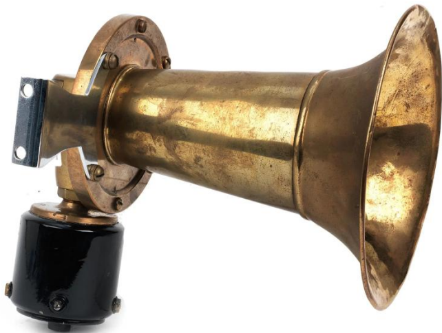
An electric car horn manufactured by Lovell-McConnell Manufacturing Company.

The Klaxon horn was invented by Miller Reese Hutchinson in 1908. However it became more commonly known as the 'Ahooga' horn from the sound it generates. Hutchinson was concerned with increased automobile traffic in New York City. An early version of a vehicle speed alarm was not readily adopted. Warning devices at the time were either bells or horns essentially derived from musical instruments. He realized that a more obnoxious sound would serve as a better warning. He designed a steel diaphragm with a pin at its center, driving the pin with a cam through either a hand crank or electric batteries via a small motor. The "horn" part of the device made the sound directional, so a pedestrian would be more likely to look in the direction of the oncoming vehicle. He licensed the patents to Lovell-McConnell Manufacturing Company in early 1908, and it was marketed as the Klaxon horn. The name came from the Greek word klaxo , meaning "shriek", which described its sound.